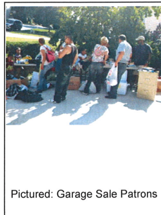
Pictured: Garage Sale Patrons